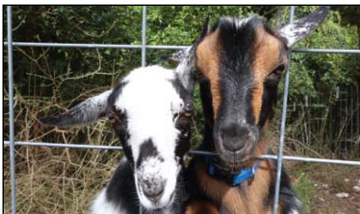
Checkers and Caesar