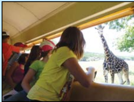
Students on a safari tour of the animal parks.