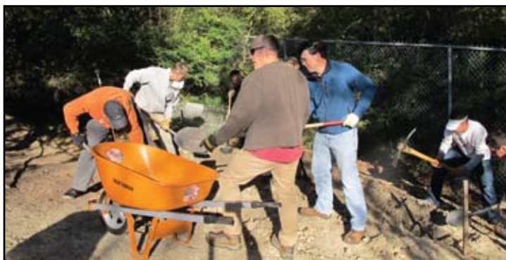
Dads working in the garden.

Many thanks to all of the families and Middle School volunteers who volunteered on one or both days.