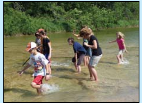
Students waded in the cool river water.