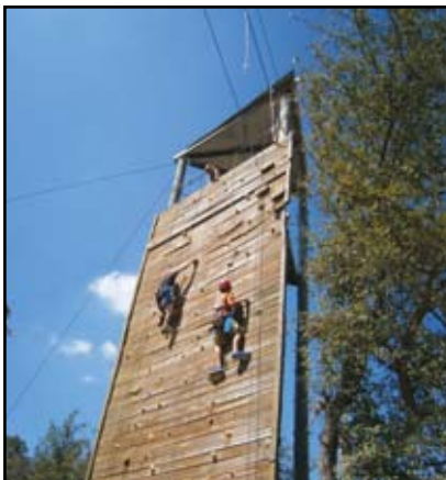
Two students scale the climbing wall.